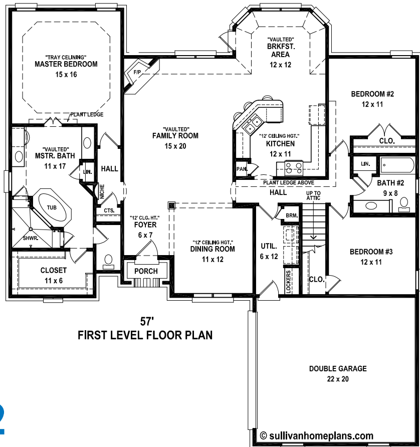
57' FIRST LEVEL FLOOR PLAN