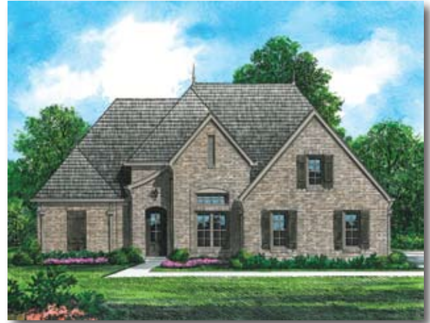
Artist rendering only and subject to change.